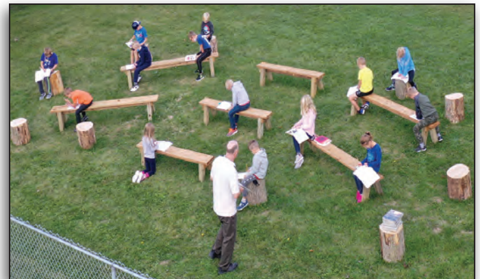
An outdoor classroom provides students mask-free breaks and the opportunity to learn outdoors