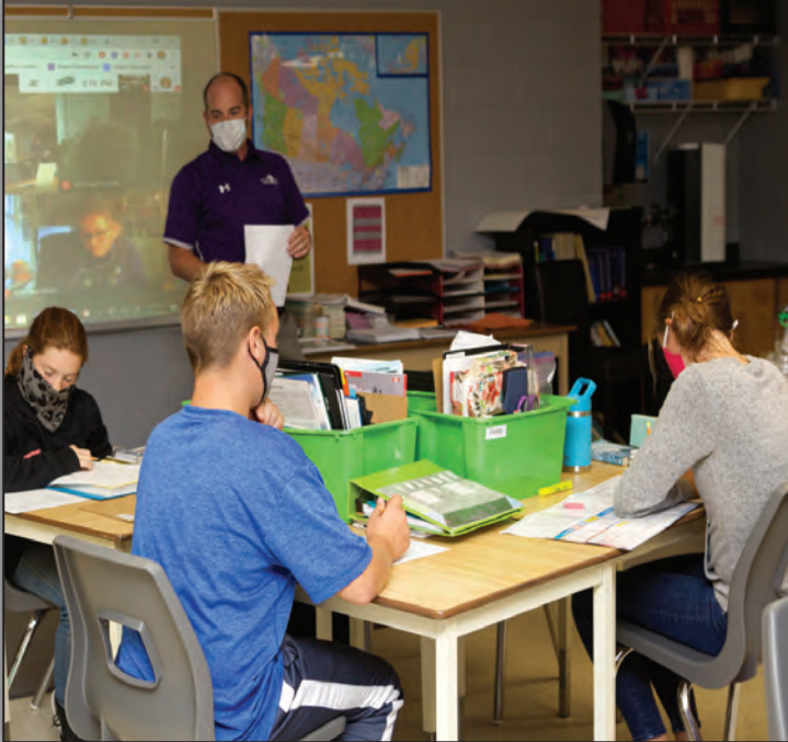
We have introduced blended learning which gives absent students the opportunity to stay connected with the class