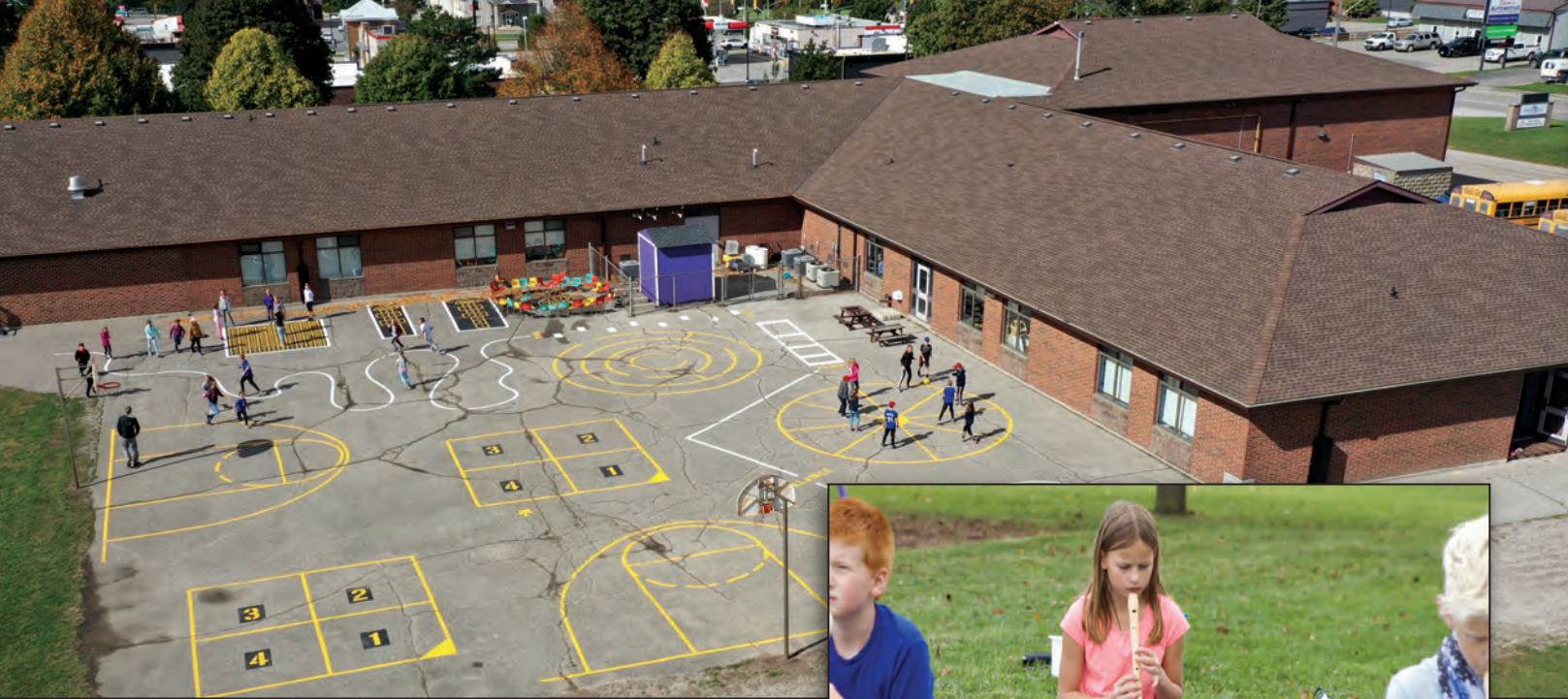
We upgraded our pavement games which gives students more options when in the different recess zones outside