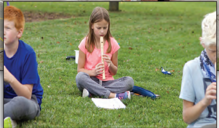
Students have been enjoying music class outside