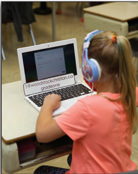
Grades 1-8 completed their MAP testing for the fall term