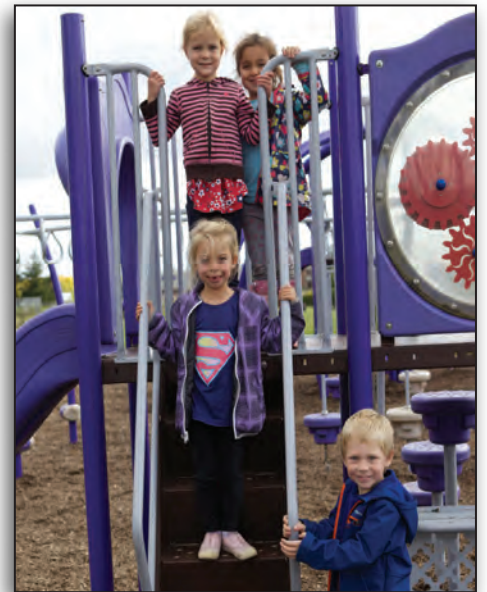
Students enjoying the playground