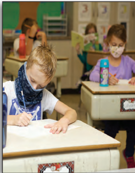
Students wearing face coverings while in the classroom busy at work!