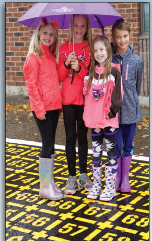
Students are so happy to be back together