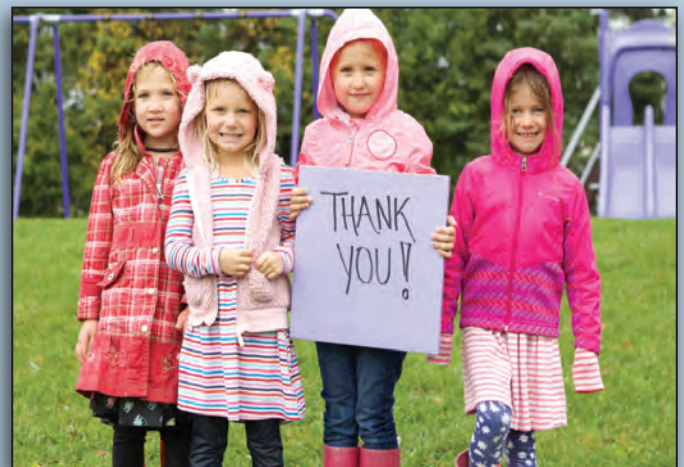
Thank you for your continued support, prayers and encouragement for WCS